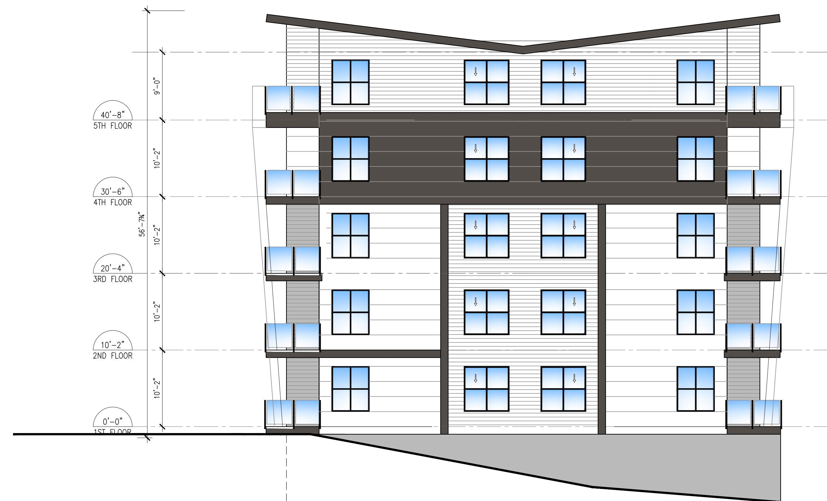
NORTHEAST ELEVATION BUILDING B

RECEIVED RA491 2023-MAY-23 Current Planning