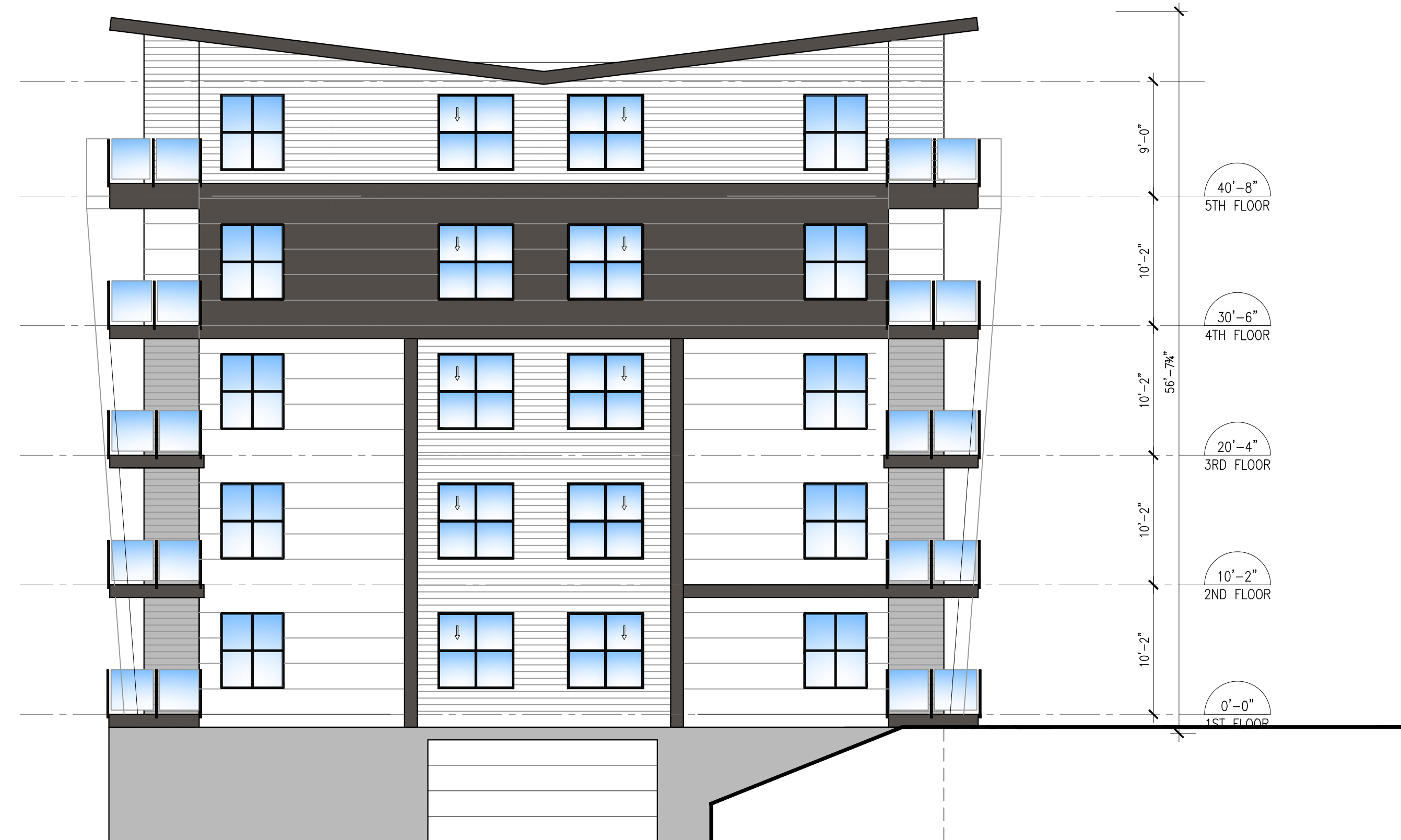
SOUTHWEST ELEVATION BUILDING B